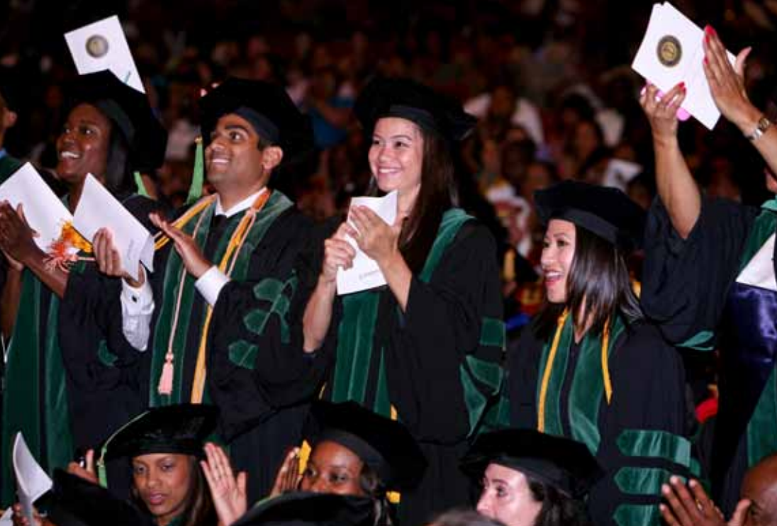
Class of 2010 celebrate at Commencement Ceremony.

Morehouse School of Medicine will be the leading community-focused, research-driven, student-centered medical school, nationally recognized for its: