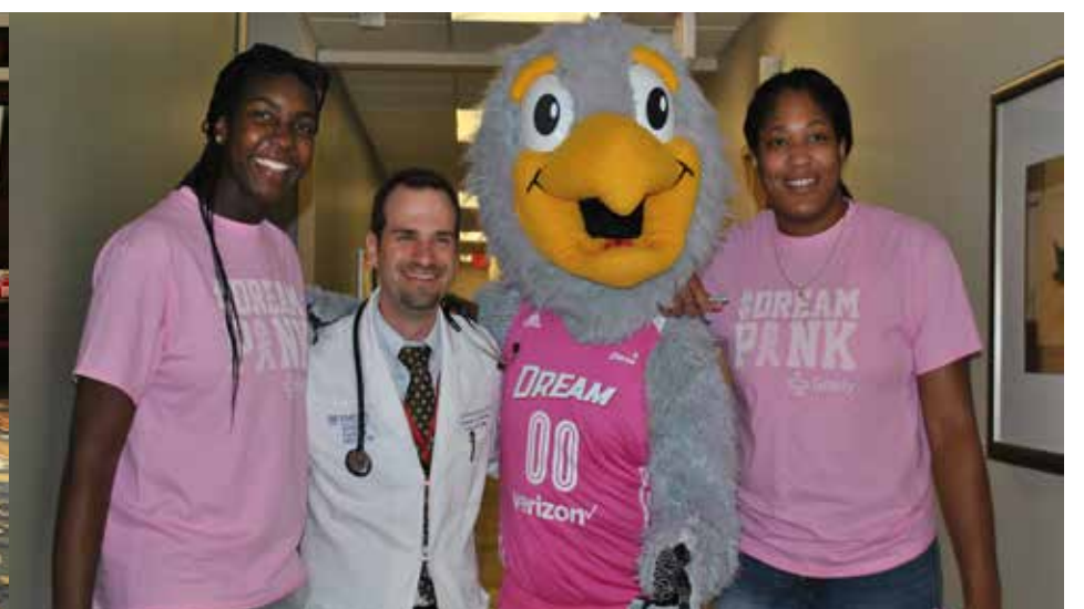
The Atlanta Dream visit the Cancer Center.