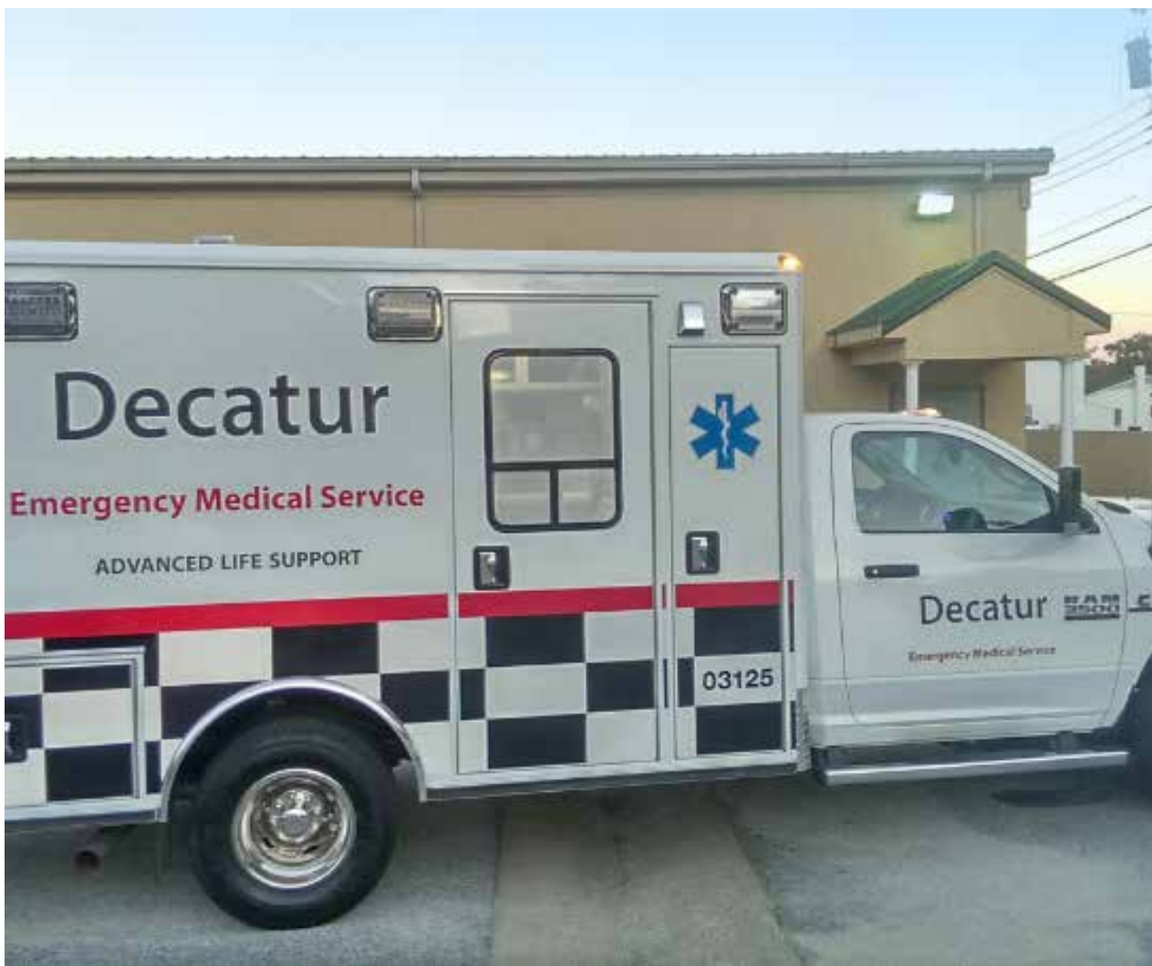
Grady EMS is the ambulance service provider of choice for five rural Georgia counties.