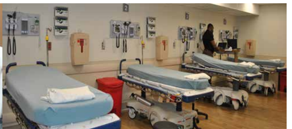
The Emergency Department celebrates another construction milestone - the newly renovated Ambulance Triage Area is now open.