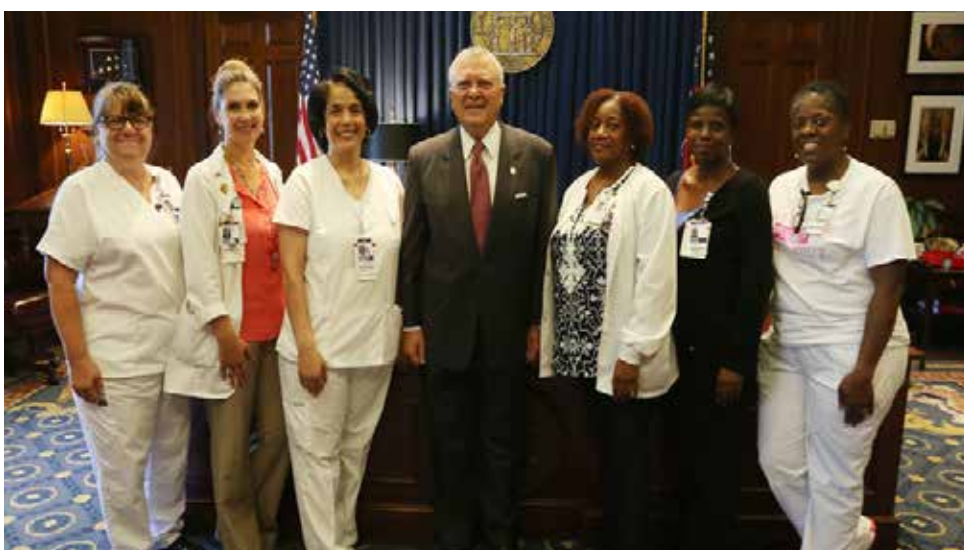
Women's Center staff celebrate the proclamation of World Breastfeeding Month with Governor Nathan Deal.