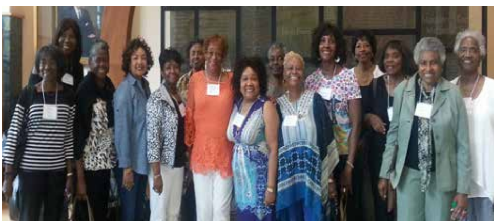
1966 Grady Nursing School graduates come for a tour.