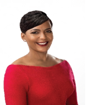
Keisha Lance Bottoms MAYOR